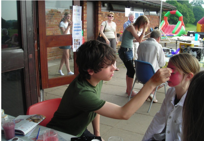
Face painting outside the Club House with its excellent facilities

Older and Younger Friends had a great time at the Old Leamingtonians Rugby Club on one of the few very hot and sunny days of the year, for a day full of fun and laughter.