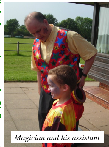
Magician and his assistant

Other entertainments on the day were a Disco, delicious Bar-B-Q and a bouncy castle - always a great favourite with youngsters.