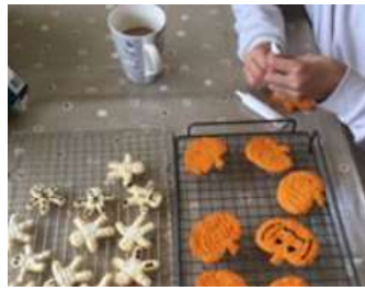
We always receive lots of photos of the wonderful creations made by Our Younger Friends with their Older Friends!