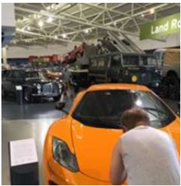
Having fun at the Motor Museum.